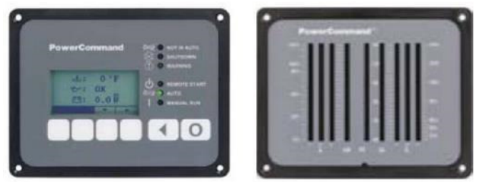
PowerCommand control is an integrated generator set control system providing voltage regulation, engine protection, operator interface and isochronous governing (optional). Major features include: